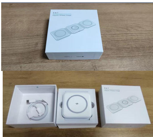
product box, 1m Type-C to Type-C cable or 1 m USB-A to Type-C cable, manual book